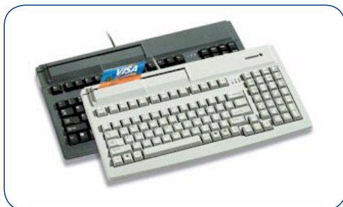
PS/2 to USB converter enable Cherry G81-8000 products to connect through USB ports