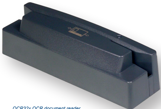
OCR32x OCR document reader